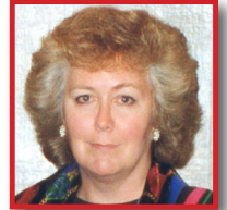
MAYOR JEAN THATCHER

Senator James Gaughran has secured for the Village $250,000 for road paving and maintenance. Many thanks to Senator Gaughran for recognizing the Village roads handle a tremendous annual volume of traffic to Caumsett State Park and for his quick response to our request for funding assistance.