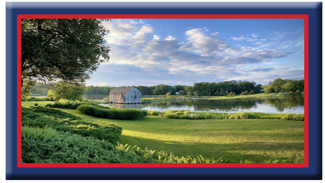
Van Wyck-Lefferts Tide Mill Sanctuary.