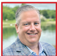
TRUSTEE/ DEPUTY MAYOR WILLIAM T. BURDO